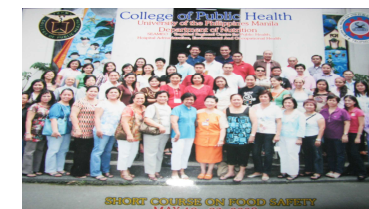
3rd Short Course on Food Safety 19-23 May 2008