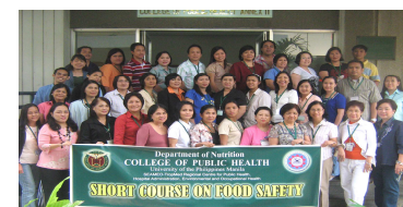
2nd Short Course on Food Safety 22-26 Oct 2007